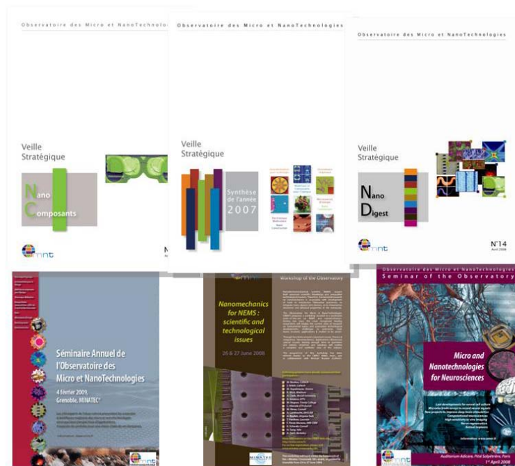
Fig. 1: Example OMNT reports and workshops

The Observatory of Micro and Nano Technologies (OMNT) is a joint unit between the CEA and the CNRS which are two French public research organisations. It was created in 2005 in order to precociously detect weak signals heralding rupture, by carrying out continuous strategic watch (both scientific and economic) on key topics of micro and nanotechnology. OMNT publishes its work through different level of analysis, answering the requests of various stakeholders through written documents and workshops.