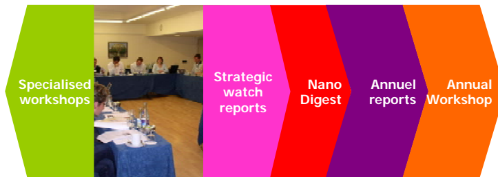
Fig. 2: Various products based on OMNT expert meetings

The Observatory of Micro and Nano Technologies manage 10 experts groups dealing with 10 different key topics of the field of micro and nanotechnologies, outlined in Figure 3.